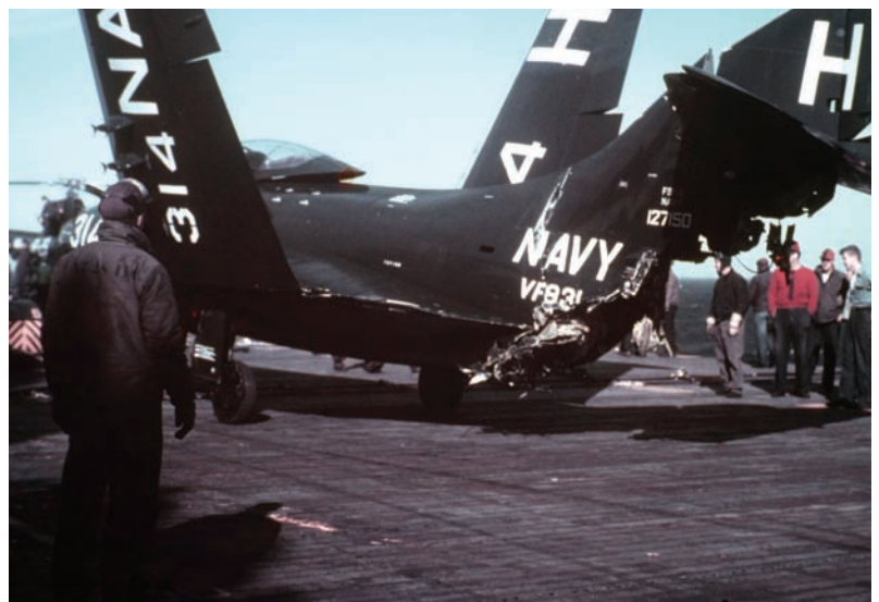
This F9F-2 from VF-831, a reserve squadron from Floyd Bennett Field was rear-ended by another Panther while landing aboard CV-36 in during its nine-month Korean War deployment (1951/1952).