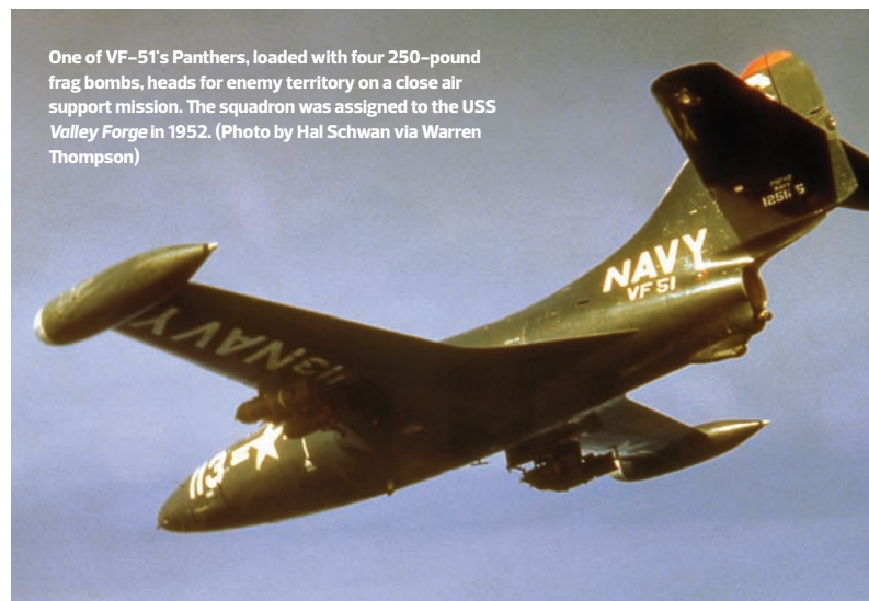
One of VF-51's Panthers, loaded with four 250-pound frag bombs, heads for enemy territory on a close air support mission. The squadron was assigned to the USS Valley Forge in 1952.

A Marine-operated Panther approaches the F.D.R. (CV-42) during a Sixth Fleet cruise in 1952. Soon after, she reported to Puget Sound for her SCB-110 series up-fitting and overhaul to an angled-deck Midway -class CVA with steam catapults and a hurricane bow.