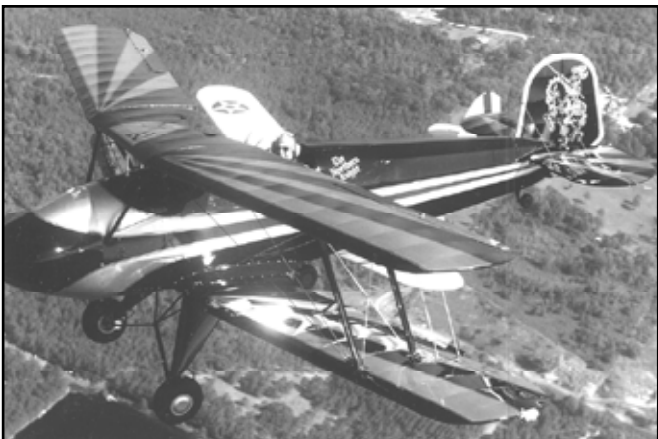
My favorite Bucker Yungmann